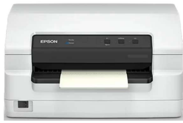
White colour printer